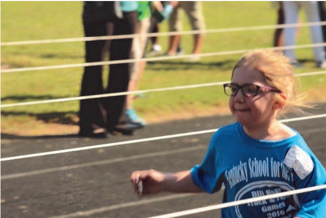
Student competing in the 2016 Bill Roby games at the Kentucky School for the Blind

The Braille Writer Loan Program provides devices to those that are in need of one. In 2017, the charitable foundation lent twelve Braille writers to blind and visually impaired individuals in Kenton, Pulaski, Hardin and other counties across Kentucky. The charitable foundation and volunteers will also clean and repair Braille writers that are loaned through this program. In 2017, the charitable foundation spent over $1,100 for Braille writer repair parts.