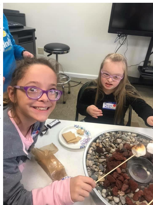
Students toasting marshmallows during an Outreach event