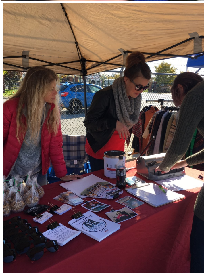
(Left) KSBCF staff at the Flea Off Market showing a passerby how to type in Braille.

Over the past year, the charitable foundation strived to bring greater awareness of services to those in the blind and visually impaired community, as well as the wider public. Through speaking events, conferences, Low Vision Clinics, and to public events around Kentucky—KSBCF reached over 5,000 people across Kentucky .