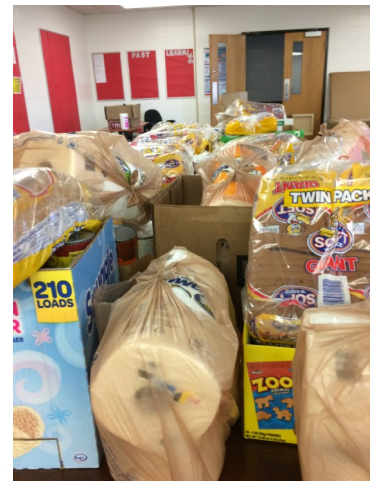
Photo of food boxes ready to handed out

None of this would have been possible if it was not for the tireless help and dedication of the KSB staff that helped with shopping (pictured below), packing, and delivery of weekly groceries. The foundation is deeply grateful for local businesses that stepped up in donating and providing much of the needed items for the food bank. A special thank you to Paul's Fruit Market that provided and delivered fresh fruit and vegetables each week, and consistently donated meat for the families. We are also thankful to Sam's Club for donating gift cards to help purchase food, Blue Dog Bakery for donating fresh bread, and Four Pegs for donating dozens of eggs.